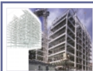
MicroStation is highly adaptable to your business needs.